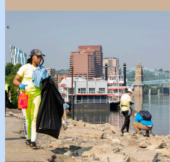
OHIO RIVER SWEEP