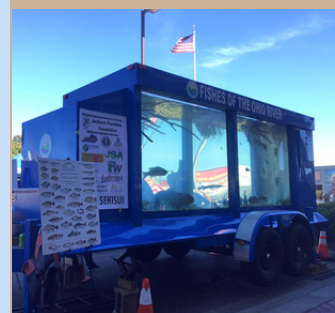
LIFE BELOW THE WATERLINE