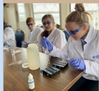
RIVER REACH ON BB RIVERBOATS